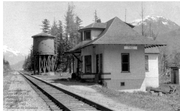
GTP Station at Tyee, 1957 5