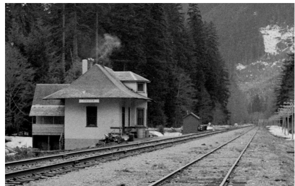
GTP Station at Exstew, 1959 6