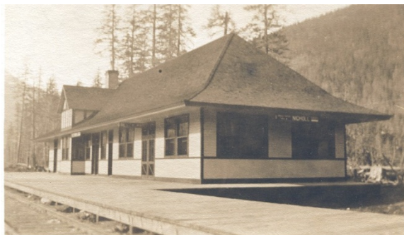
GTP Design 'F' Station at Pacific, 1914 2

* All stations were the GTP standard Design 'A' Plan 100-152 type except for the station at Pacific which was a Design 'F' Plan 100-159 station because Pacific was a divisional point. The primary difference with the Design 'F' station was that they were 18 feet longer to allow for a restaurant. The Pacific station was the same type station that is in Jasper, Alberta and Biggar Saskatchewan. The station was destroyed by fire in 1935. 1