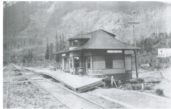
GTP Station at Usk, 1936 3