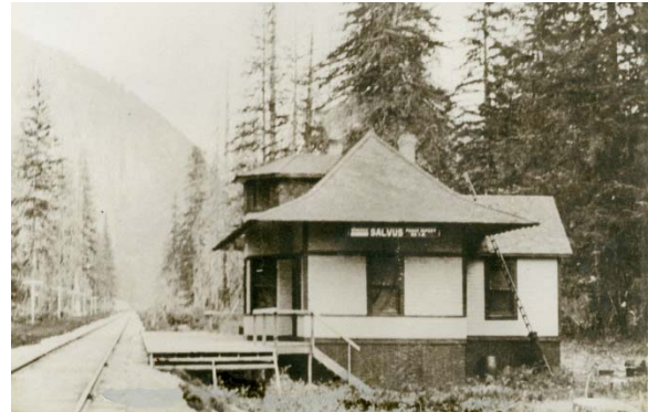
GTP Station at Salvus, c. 1914 4