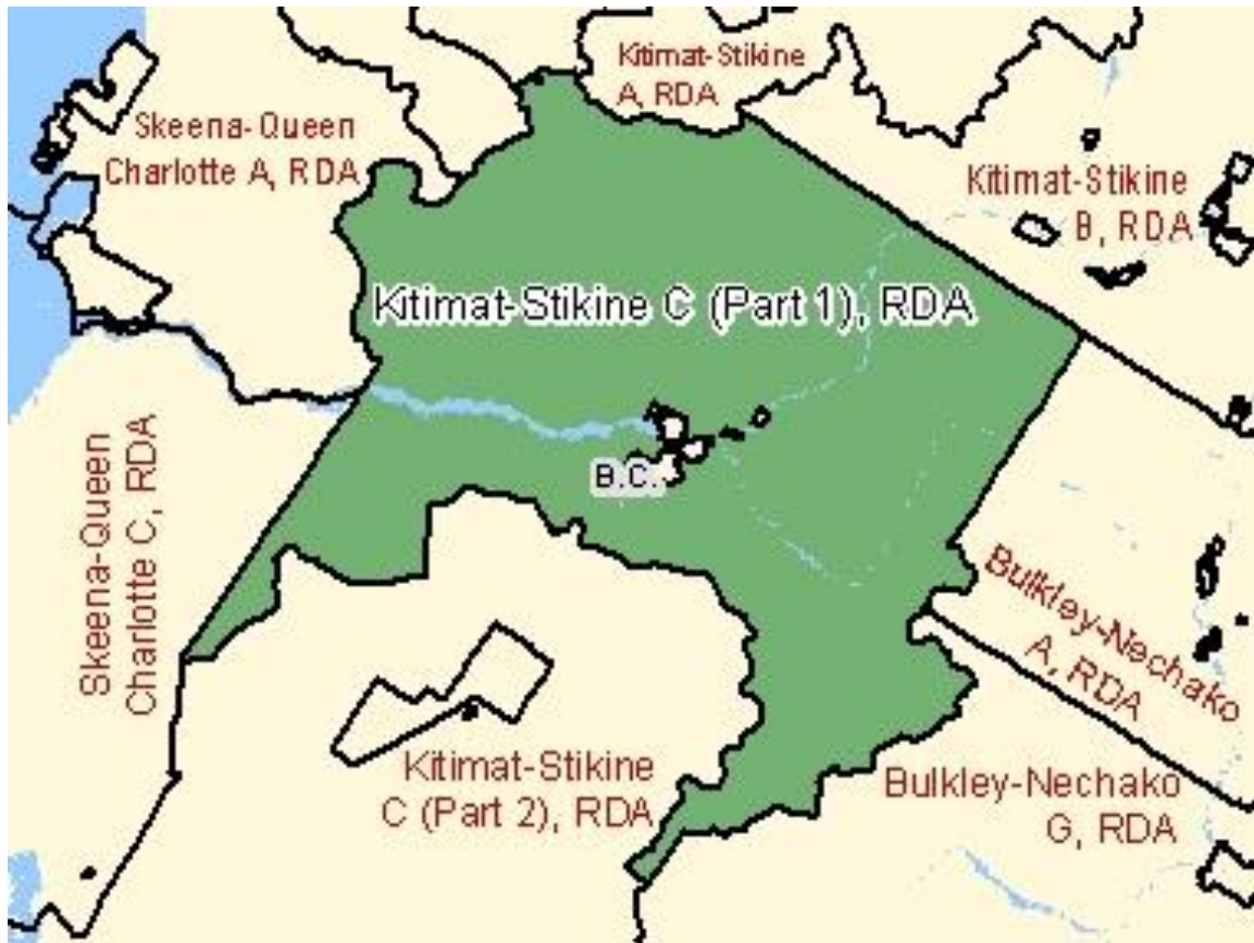
FIGURE 2 – REGIONAL DISTRICT OF KITIMAT-STIKINE C PART 1

Census of Agriculture information for GT is only available in 2011. The Census of Agriculture does not refer to GT per se and the Census of Agriculture boundaries for what is termed as GT in Appendix I tables reporting Census of Agriculture information do not exactly correspond to the boundaries described in Chapter 1, but are their closest approximation. More specifically, 2011 Census of Agriculture information used for GT consists of all of the area included within the boundaries of the Regional District of Kitimat-Stikine C part 1. This area is depicted in Figure 2. The areas in white within the green areas are included .