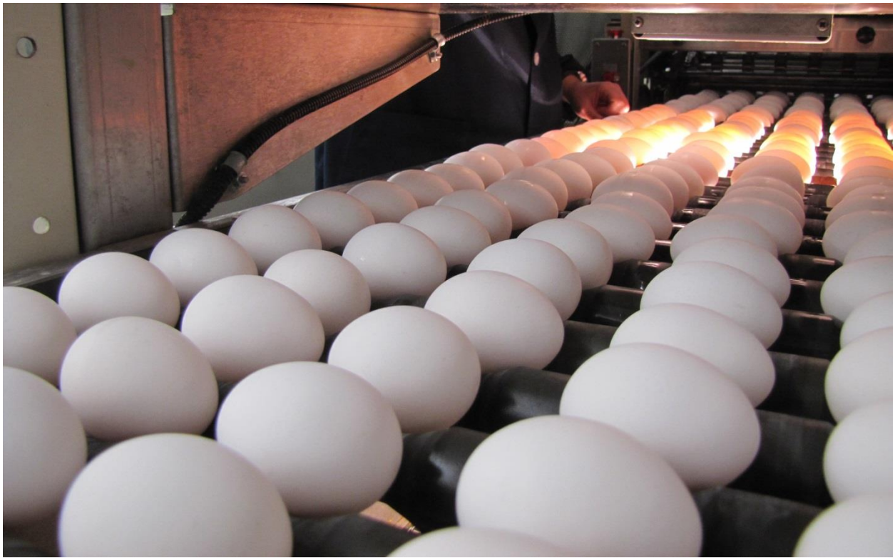
Photos: Free-run hens and eggs grading