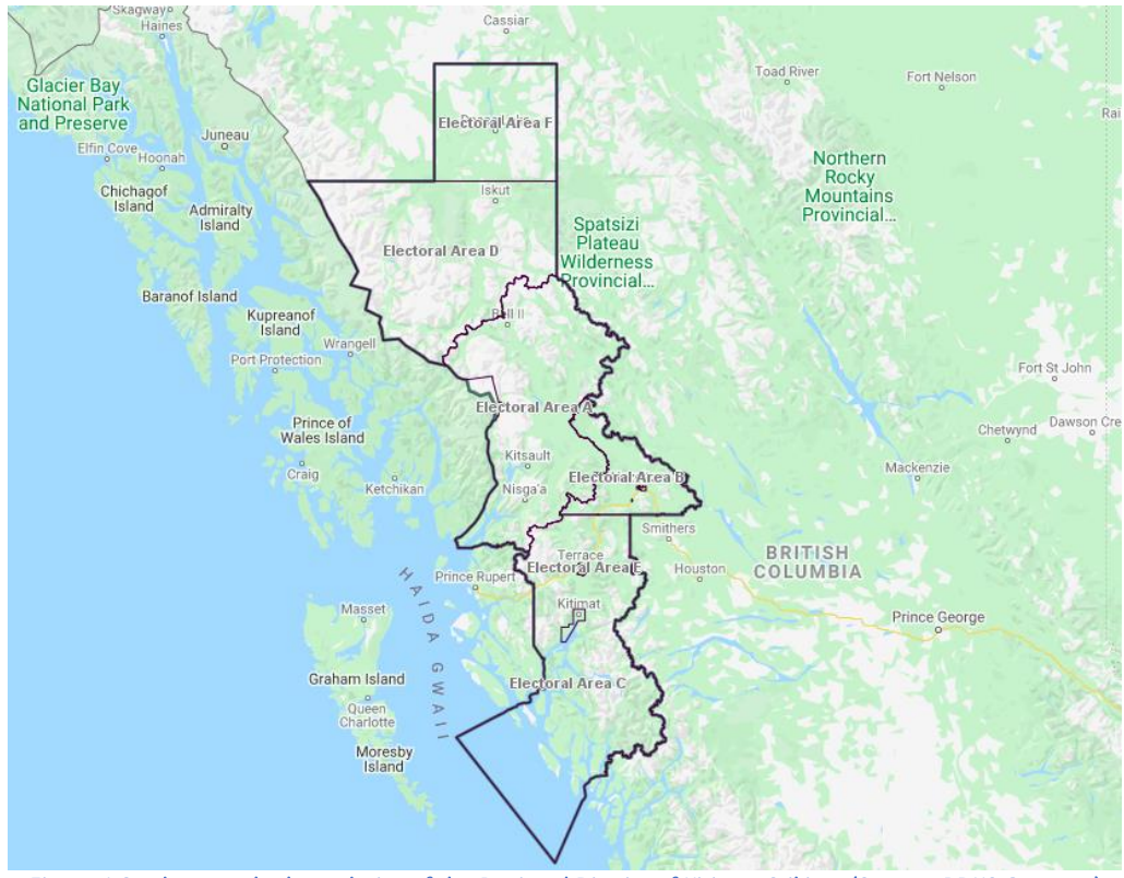
Figure 1 Study area: the boundaries of the Regional District of Kitimat-Stikine.

Situated in Northwestern British Columbia, the RDKS spans a geographic area of over 100,000 km<sup>2</sup> with a population of almost 40,000 people. The majority of residents live in the southern half of this region along Highways 16 and 37; in and around the District of Kitimat, City of Terrace and the 'Hazeltons' (Hazelton, New Hazelton and South Hazelton) (Figure 1). The agricultural producers in the region are mainly small to medium scale mixed productions farms with some limited larger operations (e.g. egg production, ranching).