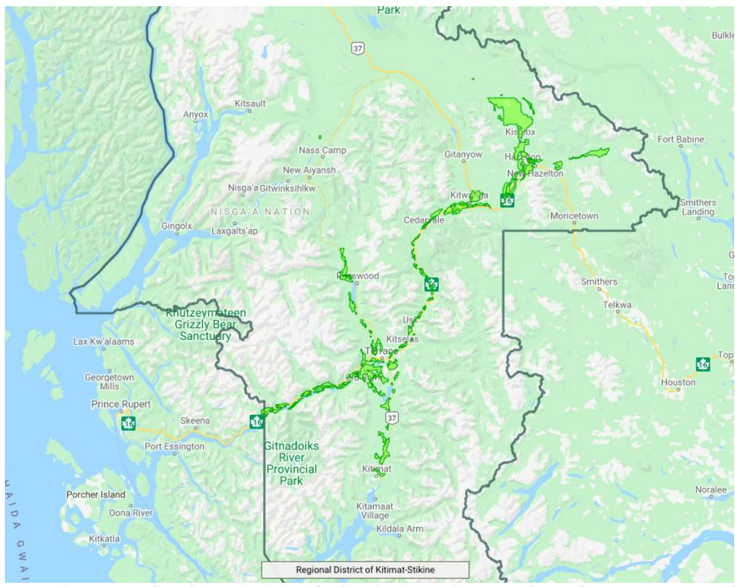
Figure 2 The majority of ALR (green shaded area) is found in the southern part of RDKS. (Source: RDKS Geomap).

The Agricultural Land Reserve (ALR) and associated agricultural capability ratings are two foundational resources that provide an understanding of agricultural potential for land in BC. The ALR is a provincially designated zone in which agriculture is recognized as the priority use. This zone comprises lands with the ability to grow food; however, the land varies in capability and suitability and therefore not all crops and livestock are feasible on all ALR lands. Agricultural activities can also occur on land outside of the ALR. It is informative to see which lands have been designated as ALR in the study area, to get an idea of certain locations that may be most fertile. There are 65,992 hectares of ALR in the RDKS. <sup>2</sup> For comparison, the neighbouring Regional District of Bulkley-Nechako has 373,544 hectares of ALR<sup>3</sup> and the North Coast Regional District has 43,195 hectares of ALR.<sup>4</sup> There is a very small number and size of ALR parcels in the northern areas of the RDKS, for example there are a limited number of small parcels around Telegraph Creek. The vast majority of the ALR parcels are located in the southern areas of the RDKS (Figure 2).