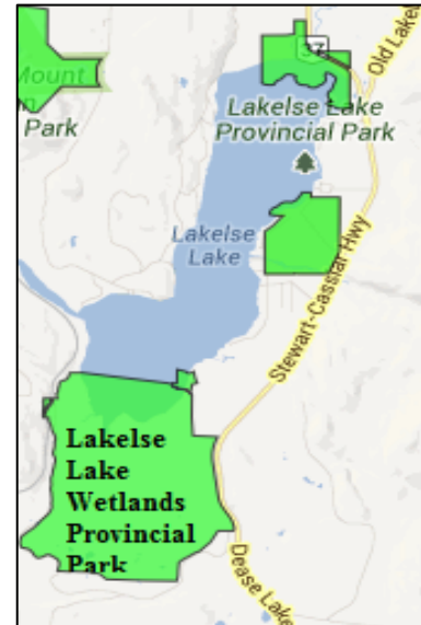
Figure 3. Provincial Parks on Lakelse Lake: Lakelse Lake Provincial Park and Lakelse Lake Wetlands Provincial Park.

*Map is for informative purposes only and does not represent legal boundaries.